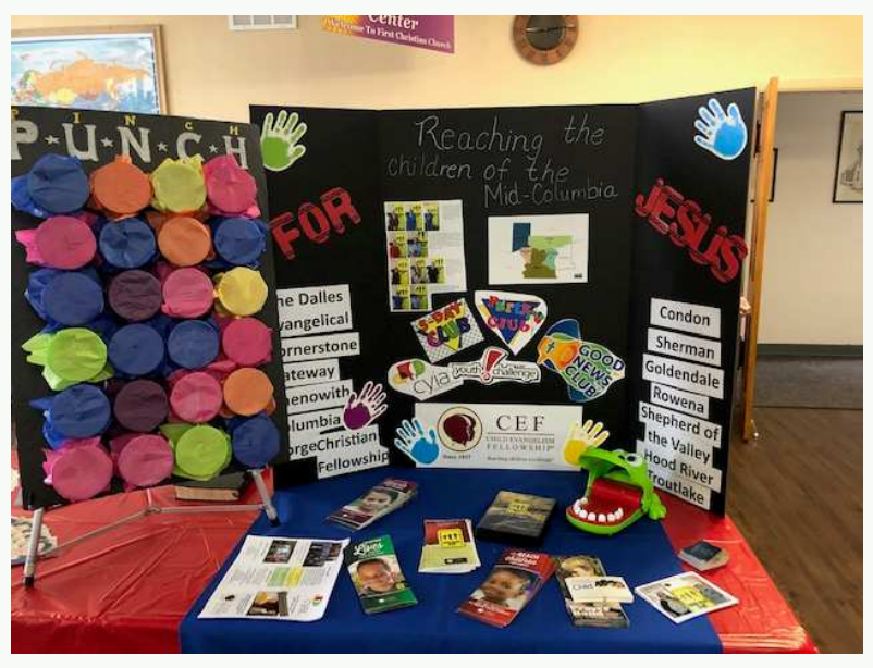
Mid-Columbia Child Evangelism Fellowship table at the First Christian Church Missions Fair